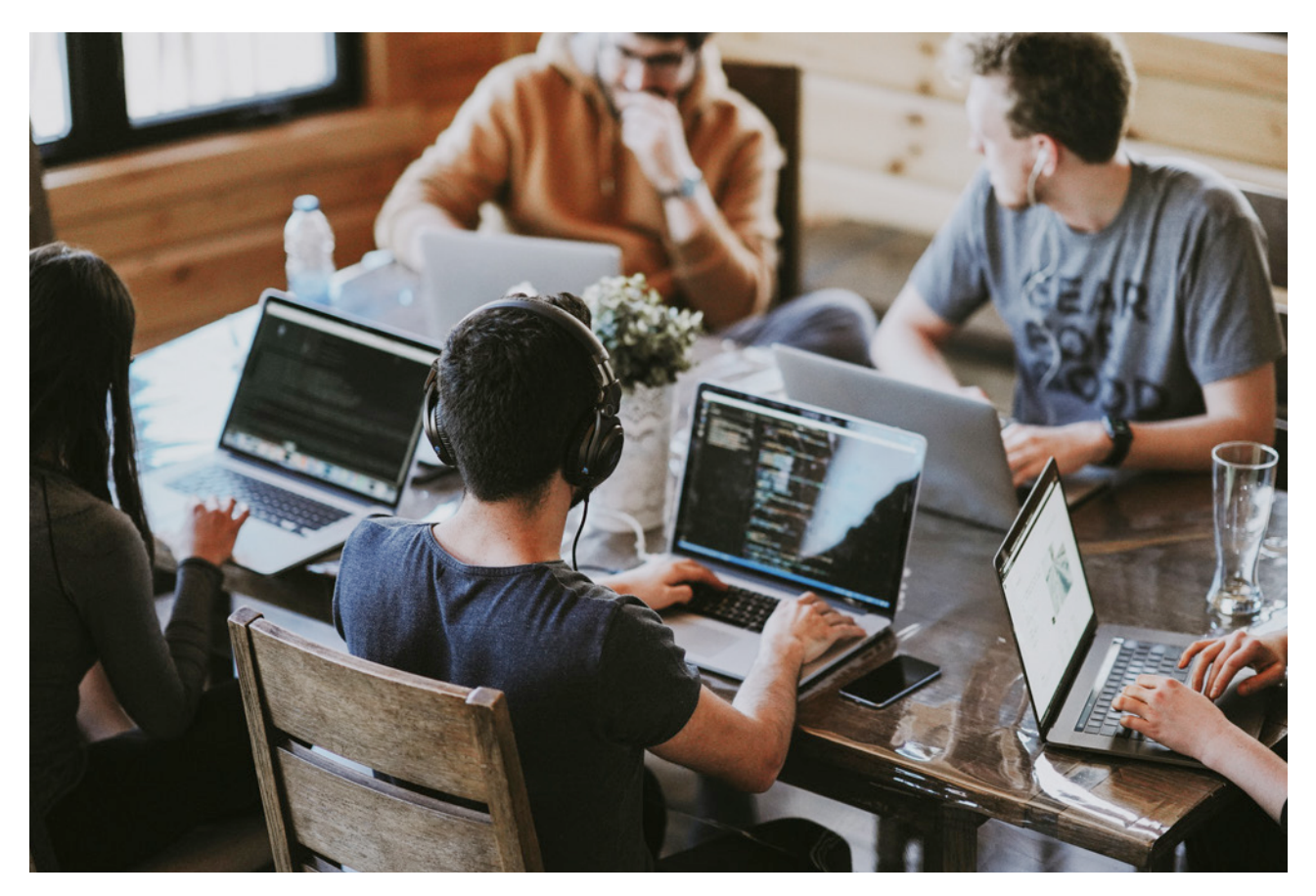
^{\scriptscriptstyle 1} How much money does your start-up need to survive the first year?', The Telegraph