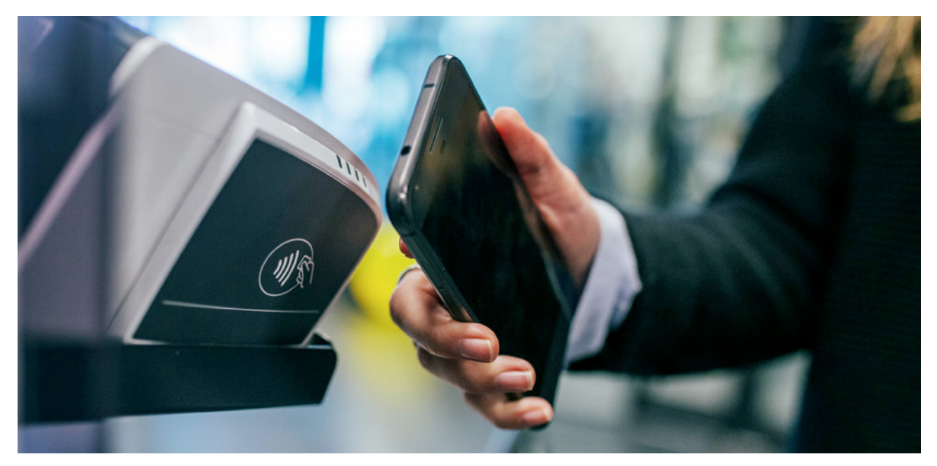
<sup>1</sup> KPMG, The Pulse of Fintech H1 2019

What is the impact of the time attributed to equity management instead of more strategic business functions? To understand this impact and assess the extent to which equity management challenges correlate to overall company success, Qadre conducted an independent survey of 59 UK fintech founders.