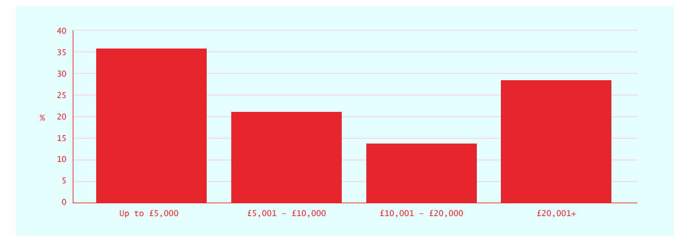
Chart 1. How much have you spent on legal and accountancy fees to-date to set up and manage your equity?

There are also a number of firms who choose to outsource their equity management to external specialists - usually lawyers. Almost a quarter of fintech founders (24%) admitted to spending over 10 hours per funding round on professional advice to structure their investment. This external support is costly. As many as 35% said they had spent up to £5,000 on legal and accountancy fees to set-up and manage their equity and a further 28% admitted to spending over £20,000.